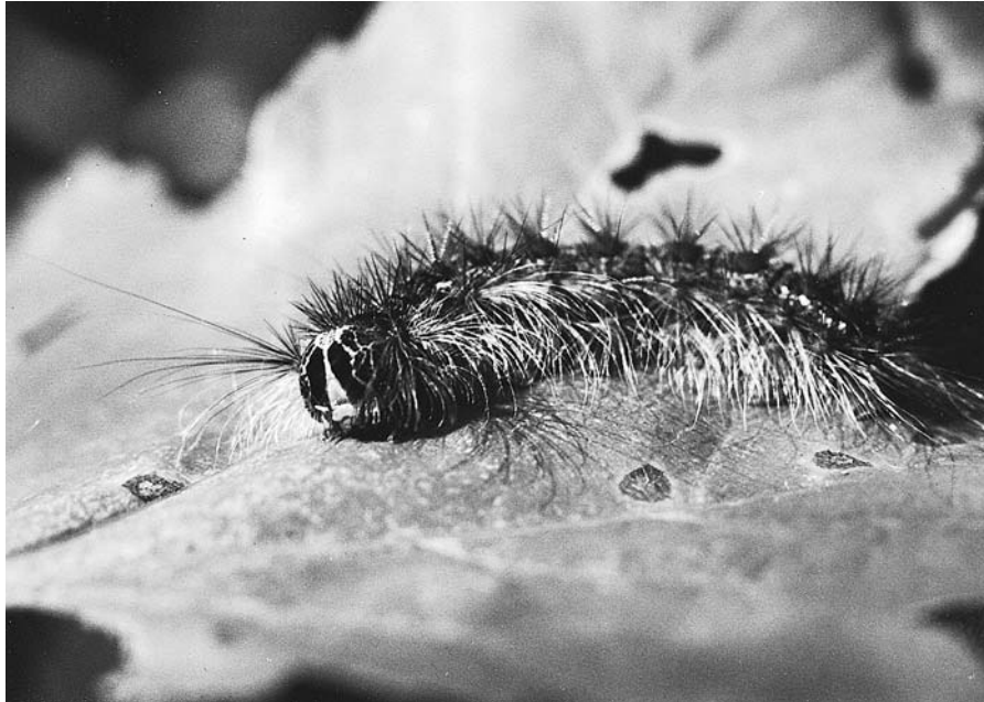
PLATE 1. Larval gypsy moth ( Lymantria dispar ). Limited larval dispersal and flightlessness of adult female gypsy moths may act in combination to allow the vulnerable pupal stage to nongenetically “inherit” areas of low predation risk, where their mothers survived to lay eggs.

parameter. Previous analytical frameworks for modeling population dynamics in heterogeneous space have typically been restricted to situations in which the environmental pattern is constant over time (Muko and Iwasa 2000, Bolker 2003, Snyder and Chesson 2003, Goodwin et al. 2005) or is redistributed completely between generations (May 1978). Although some fitness-related factors (e.g., topography) are essentially fixed, others (e.g., local weather) have little continuity over time, others may be autoregressive, and still others, like the home ranges of long-lived predators, may themselves move in space at a characteristic rate. Incorporating such a complex suite of factors on the distribution of suitability in a spatially explicit model would require many parameters, each of which is likely to be weakly supported by data. In the framework we describe here, temporal change in the spatial pattern of environmental suitability simply reduces spatiotemporal autocorrelation (especially at short distances), thereby reducing I_S^2 .